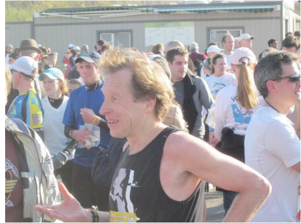
Can you name this famous running celebrity spotted at the Cherry Blossom 10-Miler?