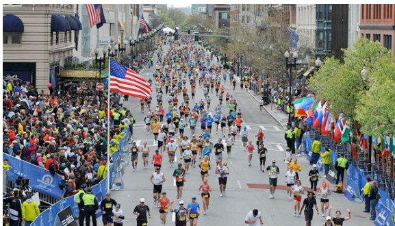
The flag at the finish area of the Boston Marathon.