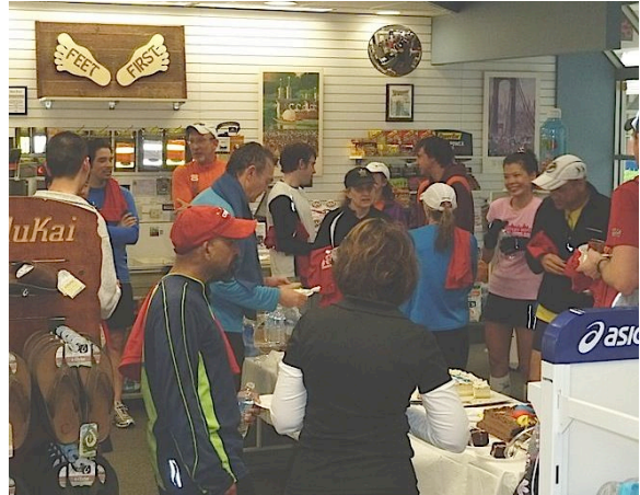
A huge crowd crammed inside Feet First to celebrate the store's 32 years in Columbia.