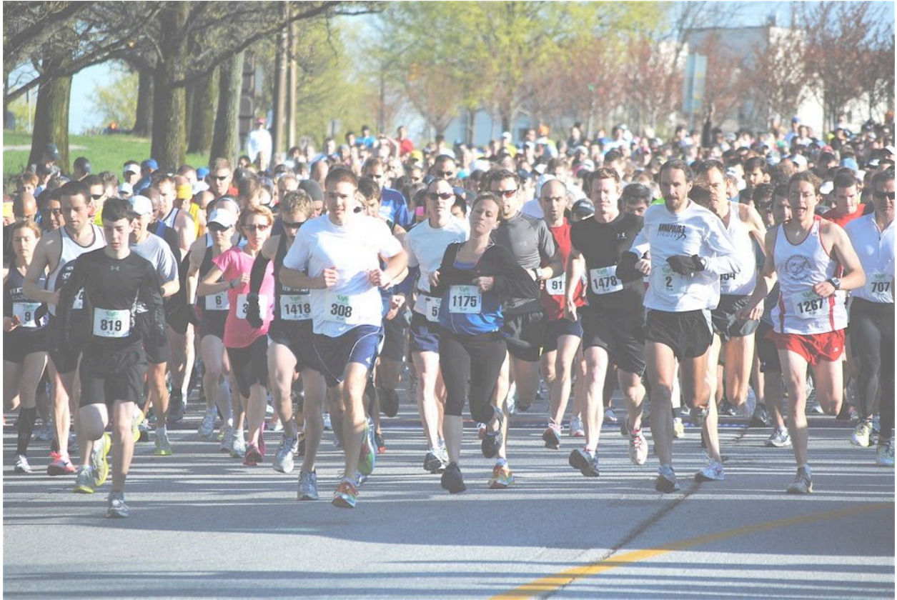
Hundreds upon hundreds of runners pour across the starting line of the 2011 Clyde's 10k.