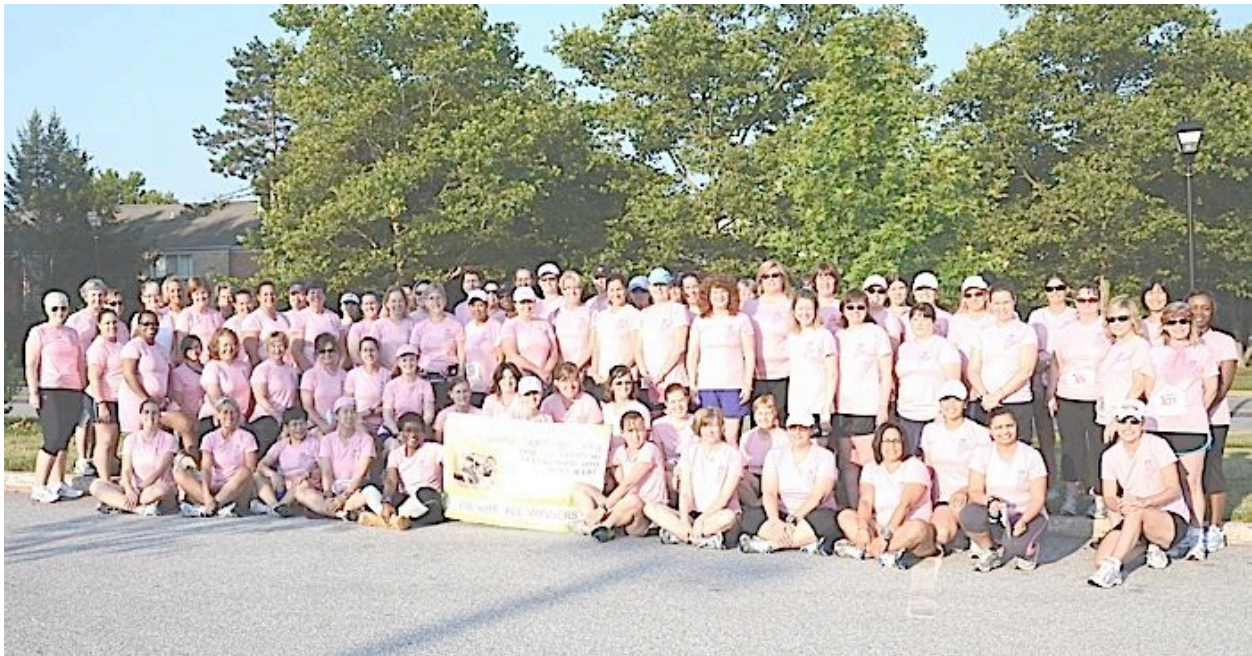
The 2011 Females in Training posed in their pink t-shirts just before the 5k Women's Distance Festival.