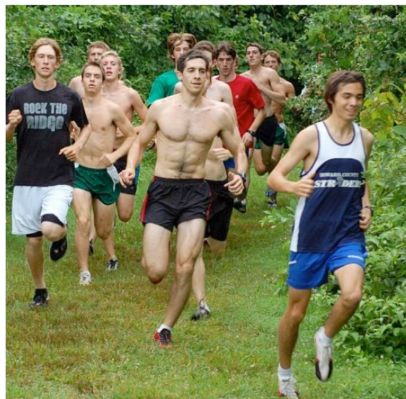
Runners break from the trees at River Hill on August 2.